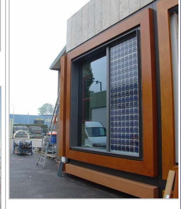
Library façade mock-up